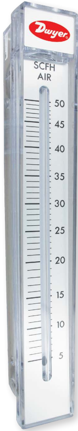
Model RMC 10" scale, 15-3/8" high