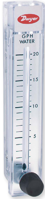
Model RMB-SSV 5" scale, 8-3/4" high