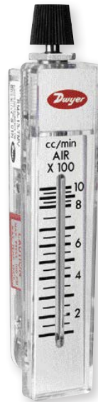
Model RMA-TMV 2" scale, 4-13/16" high